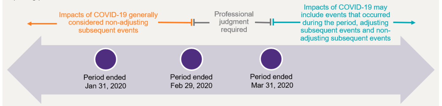
Audit | Tax | Advisory © 2020 Grant Thornton LLP. A Canadian Member of Grant Thornton International Ltd

The diagram below depicts how your entity may reflect the impacts of COVID-19 in its financial statements, depending on its reporting period end date: